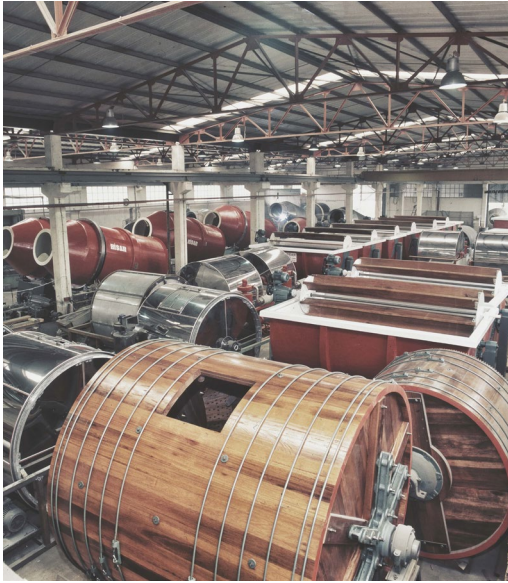
[2700 square meters of production area]